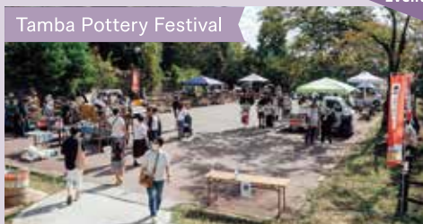
Tamba Pottery Festival

Address: Kamitachikui, Konda cho, Tambasasayama city