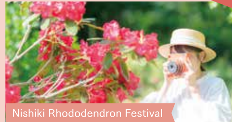
Nishiki Rhododendron Festival

Rhododendron used to be a town flower of former Nishiki-town. The idiom "Takane no Hana" which means unattainable object comes from this flower because it blooms in such a high mountain that it is difficult to obtain. Every April, when stunning beautiful rhododendron is in full bloom, Nishiki Rhododendron Festival is held along with other activities.