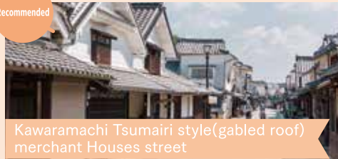
Kawaramachi Tsumairi style(gabled roof) merchant Houses street

This street is lined with historic merchant houses that have narrow frontage, deep in depth and Tsumairi style gabled roofs. It stretches for about 600 meters and still retains strong traces of the feudal era, Edo period. You can enjoy delicious foods and souvenir shopping while strolling the street.