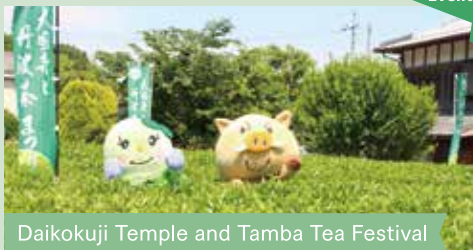
Daikokuji Temple and Tamba Tea Festival

Held every June, Tamba Tea Festival features fresh tea sales, a photo session with cha-musume (girls dressed in tea picking uniform), workshops, exhibitions and more. You can savor the charm of Tambasasayama Tea which grew up in the land of abundant nature.